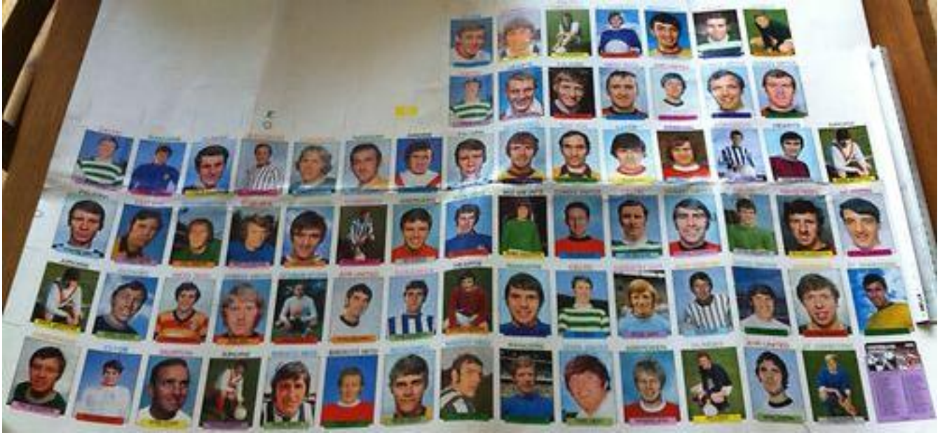
Scottish 1971/72 Purple Backs - Series 2 - printers proof layout

In Newsletter Number 20 this website displayed some printer's proofs of A&BC Chewing Gum Scottish football cards, including a map of the layout of the cards for Series 1. Thanks to Jerry we are now able to also provide the layout for the Series 2 proof sheet.